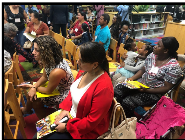
Families of kindergartners at Santa Clara Elementary School in Allapattah, shown here, will benefit from a new nonprofit program establishing savings accounts with seed funding from the city of Miami

Parents of eligible kindergartners have a month to activate the free accounts. There are no fees and no minimum deposits or balances. Students cannot access the funding until they are 18.